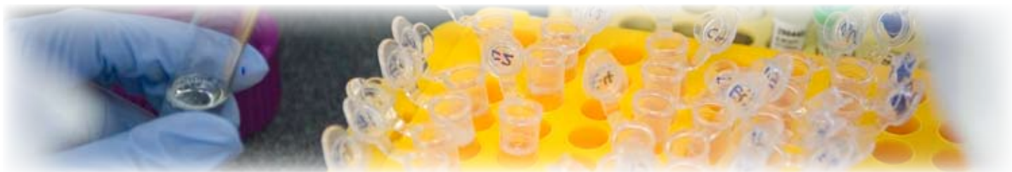
Table 4: Some Drugs That Cause or Exacerbate Porphyria (Elevation of Total Porphyrins)

Aluminum inhibits some heme synthetic enzymes and has been implicated in causing porphyria in chronic hemodialysis patients, whom are often aluminum overloaded. Lead intoxication causes signs and symptoms similar to acute intermittent porphyria including abdominal pain, constipation and vomiting. However, anemia which is often found with lead intoxication may be absent in lower lead exposures that generate porphyria, indicating that the overall flux through the porphyrin pathway is not strongly reduced even though significant amounts of intermediates are spilled, due to the toxicant effect.