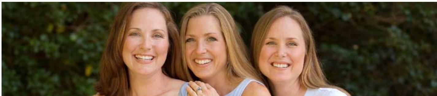
Table 5: Environmental Mediators of Toxic Porphyrins That May Cause Hepta-, Hexa-, or Pentacarboxy porphyrinurias.

Hexachlorobenzene exposure in adults results in cutaneous photosensitivity and porphyrinuria. However, in infants, exposure results in high mortality and neurotoxicity (convulsions) without porphyrinuria. Aluminum inhibits some heme synthetic enzymes and has been implicated in causing porphyria in chronic hemodialysis patients, whom are often aluminum overloaded. Lead intoxication causes signs and symptoms similar to acute intermittent porphyria including abdominal pain, constipation and vomiting. However, anemia which is often found with lead intoxication is virtually absent in porphyria.